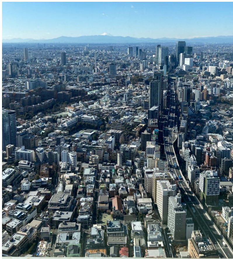
Tokyo, Japan (that's Mt. Fuji in the background).